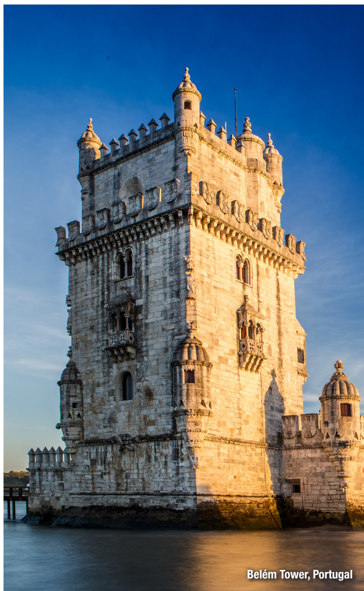
Belém Tower, Portugal