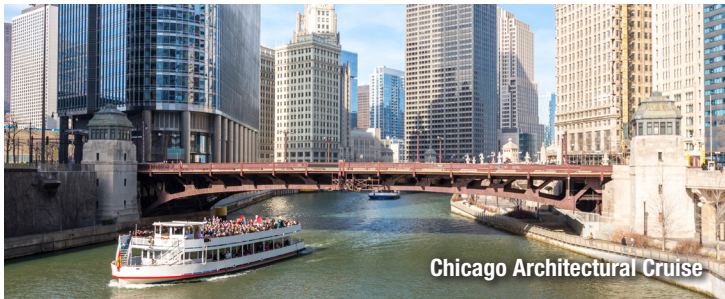
Chicago Architectural Cruise